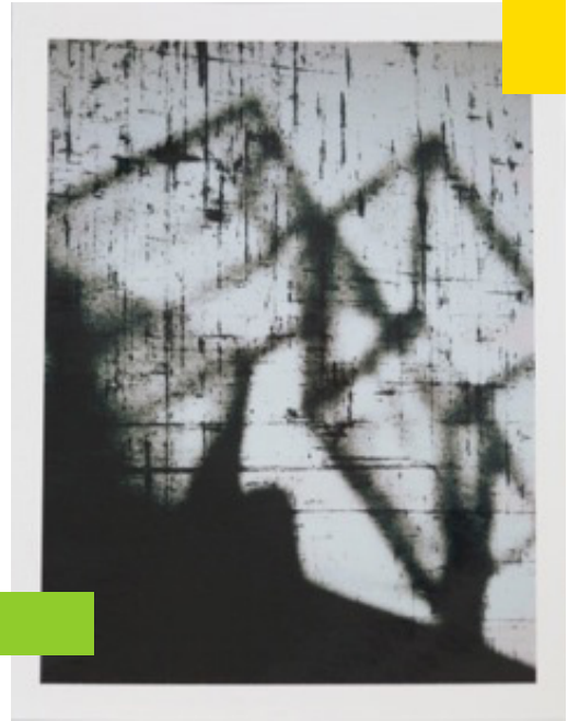
Miranda Lichtenstein, "Polaroids", New York #6 , 2014