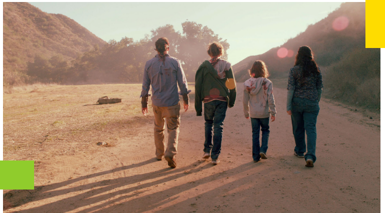
Extrait du film Sunday Morning (Part III Of The Tunnel) , Omer Fast, 2010 (5'30)