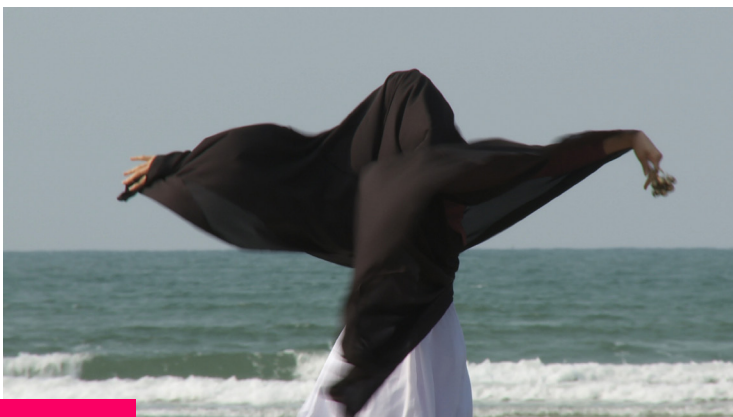
Extrait du film Do Not Harm Your Ghost , Hwayeon Nam, 2010 (16'40)

CLIFF EVANS Citizen: The Wolf and Nanny , 2009 (6'30)