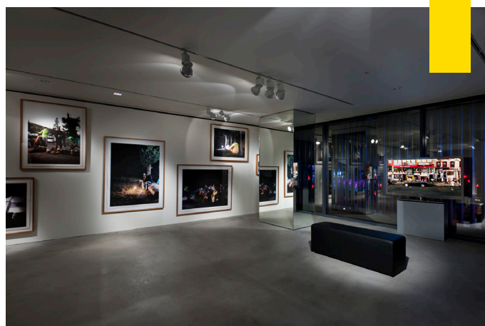
Yeondoo Jung, installation view of "Ordinary Paradise", 2010

"No Need For Forever" from October 9 to November 29, 2009