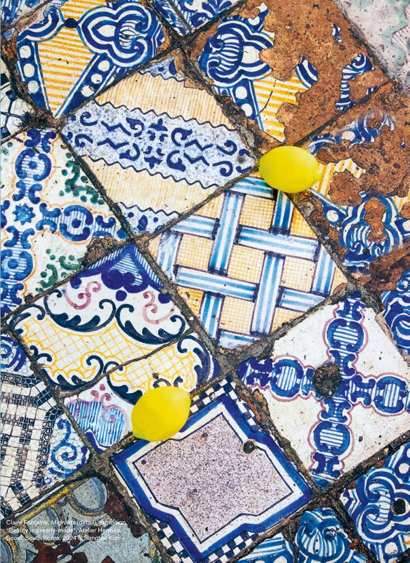
Claire Fontaine, Migrants (detail), exhibition "Beauty is a ready-made", Atelier Hermès, Seoul, South Korea, 2024