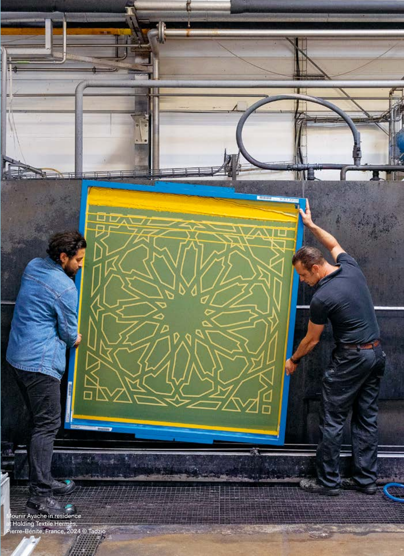
Mounir Ayache in residence at Holding Textile Hermès, Pierre-Bénite, France, 2024