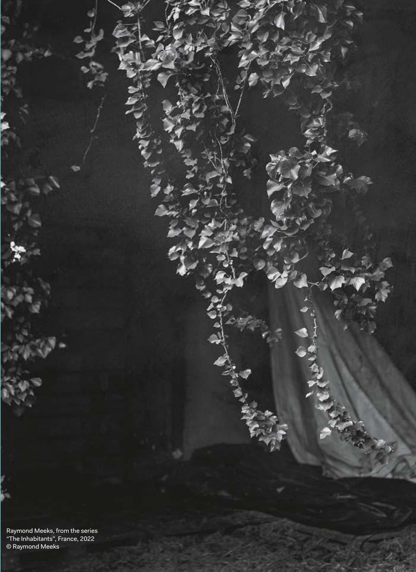
Raymond Meeks, from the series "The Inhabitants", France, 2022 © Raymond Meeks