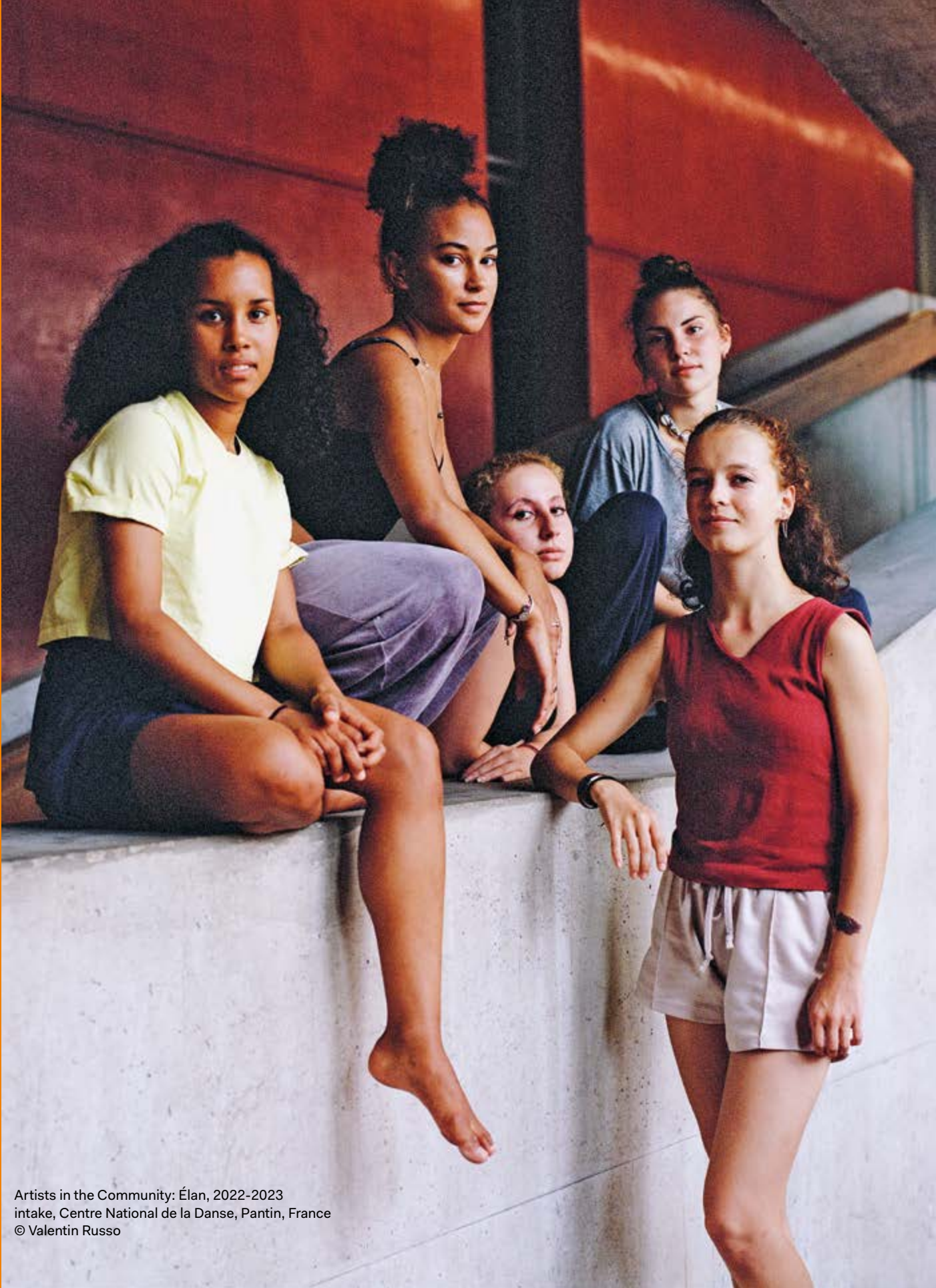
Artists in the Community: Élan, 2022-2023 intake, Centre National de la Danse, Pantin, France