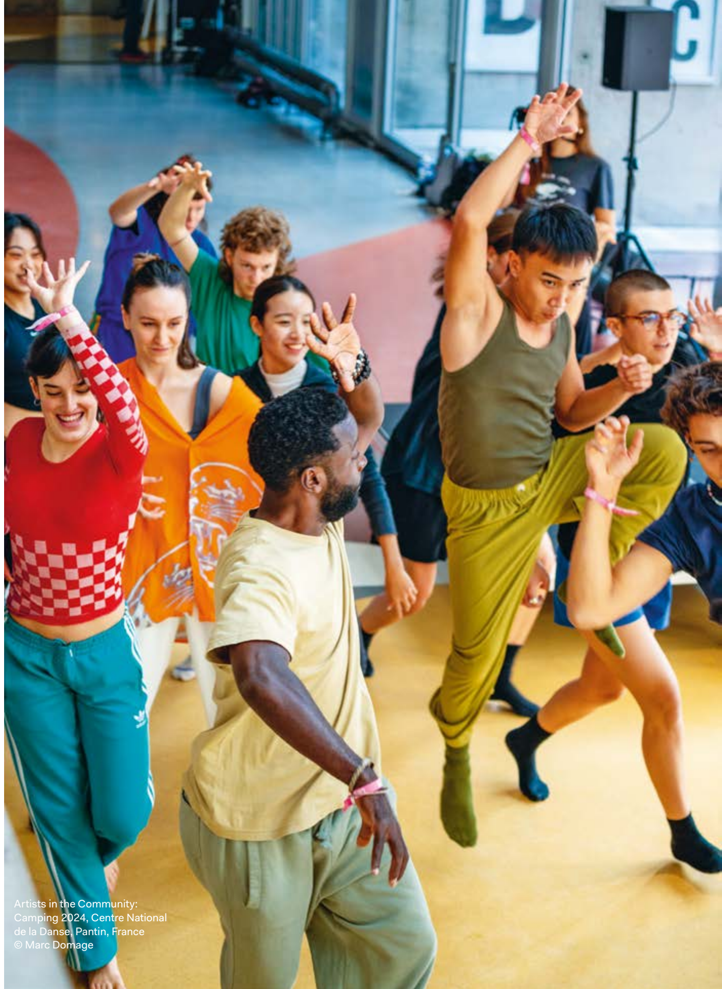
Artists in the Community: Camping 2024, Centre National de la Danse, Pantin, France © Marc Damage