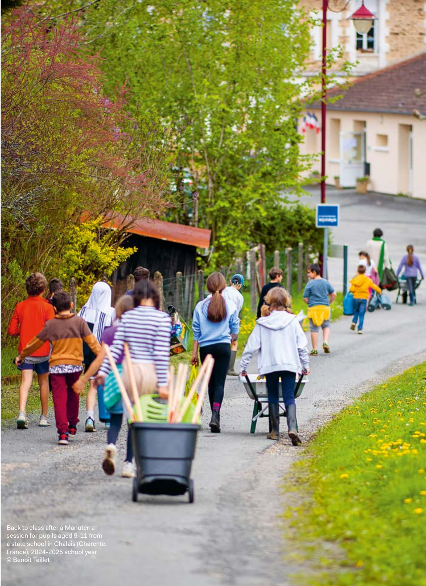
Back to class after a Manuterra session for pupils aged 9-11 from a state school in Chalais (Charente, France), 2024-2025 school year