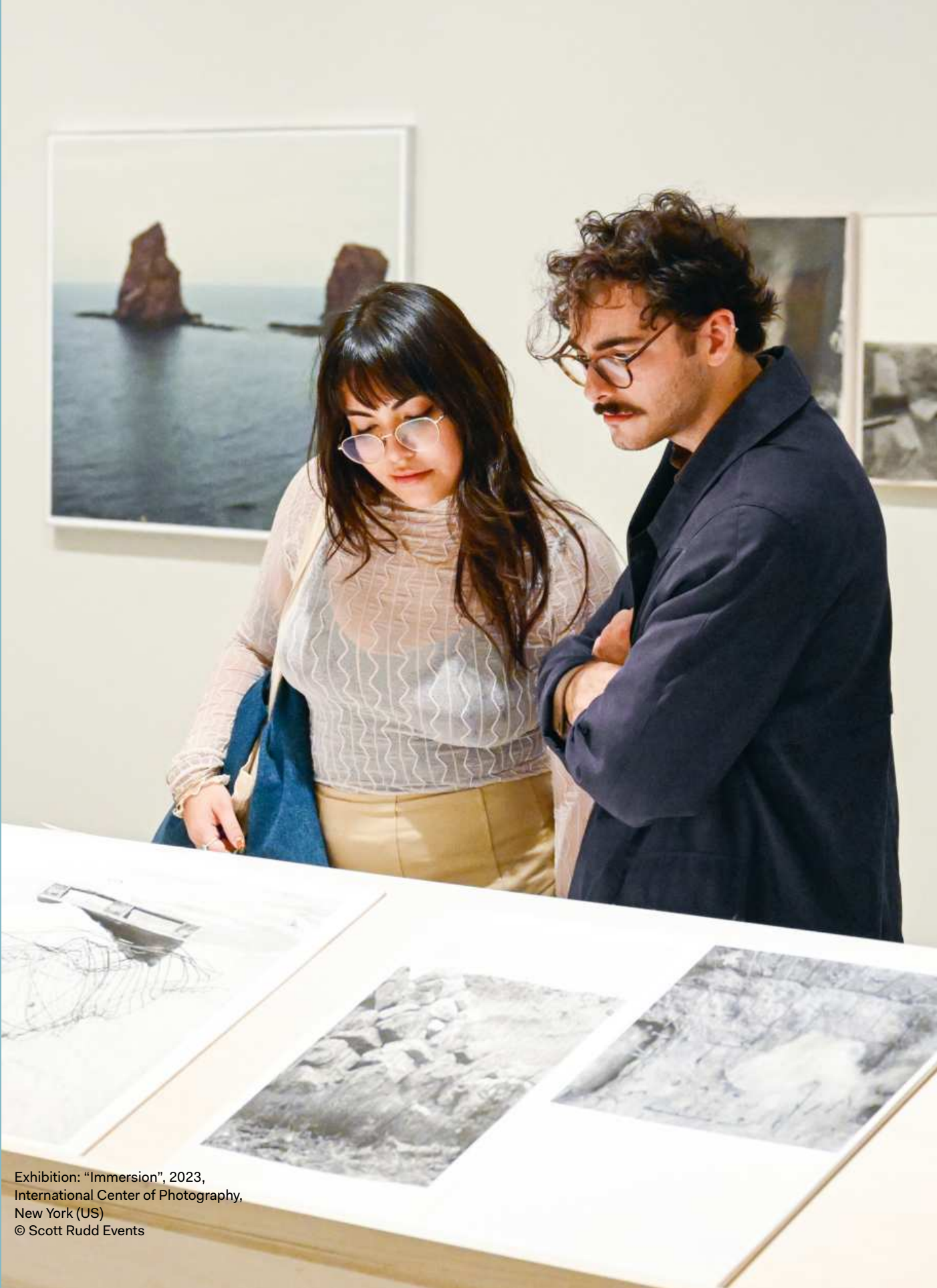
Exhibition: "Immersion", 2023, International Center of Photography, New York (US)