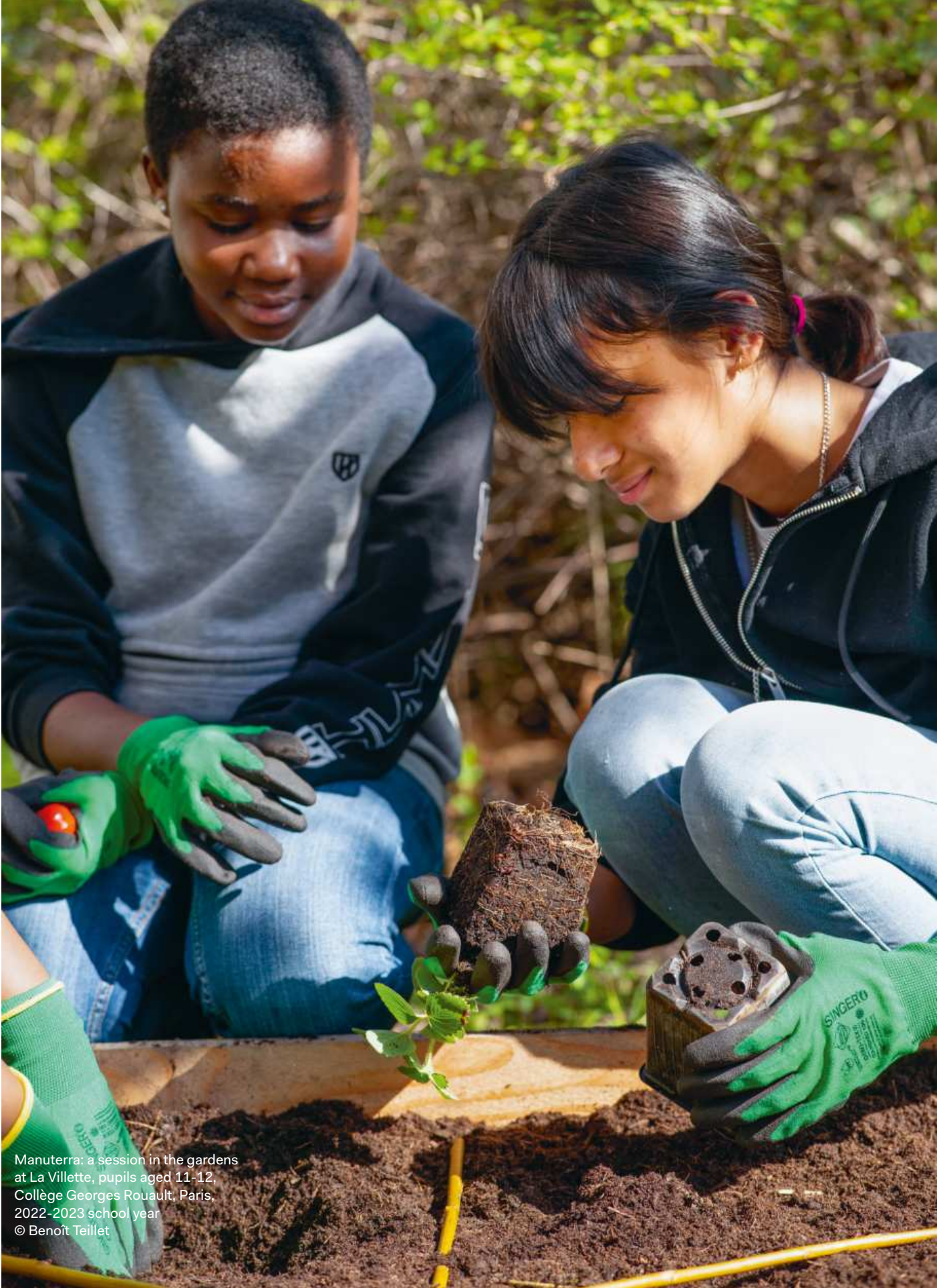
Manuterra: a session in the gardens at La Villette, pupils aged 11-12, Collège Georges Rouault, Paris, 2022-2023 school year