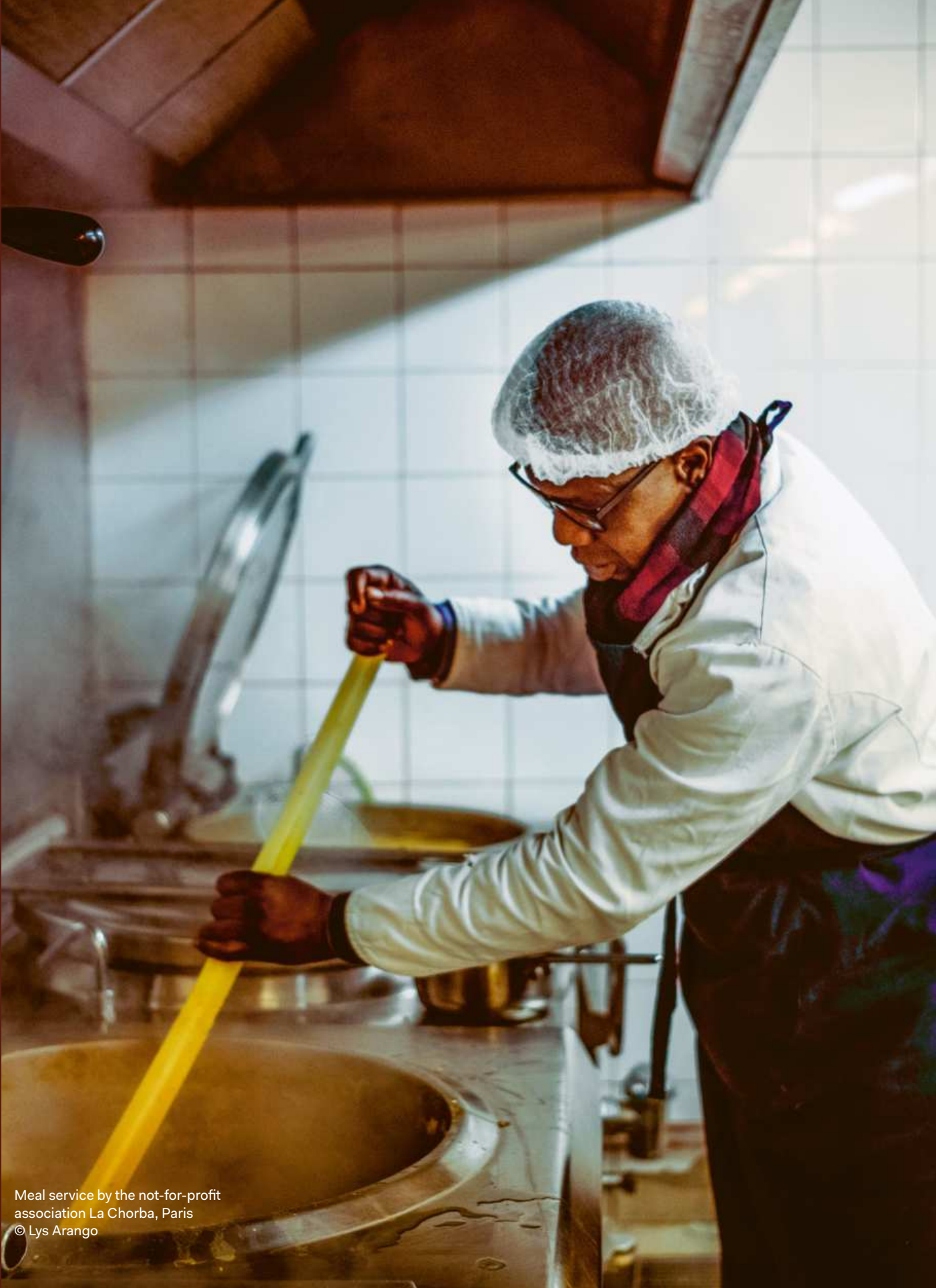
Meal service by the not-for-profit association La Chorba, Paris