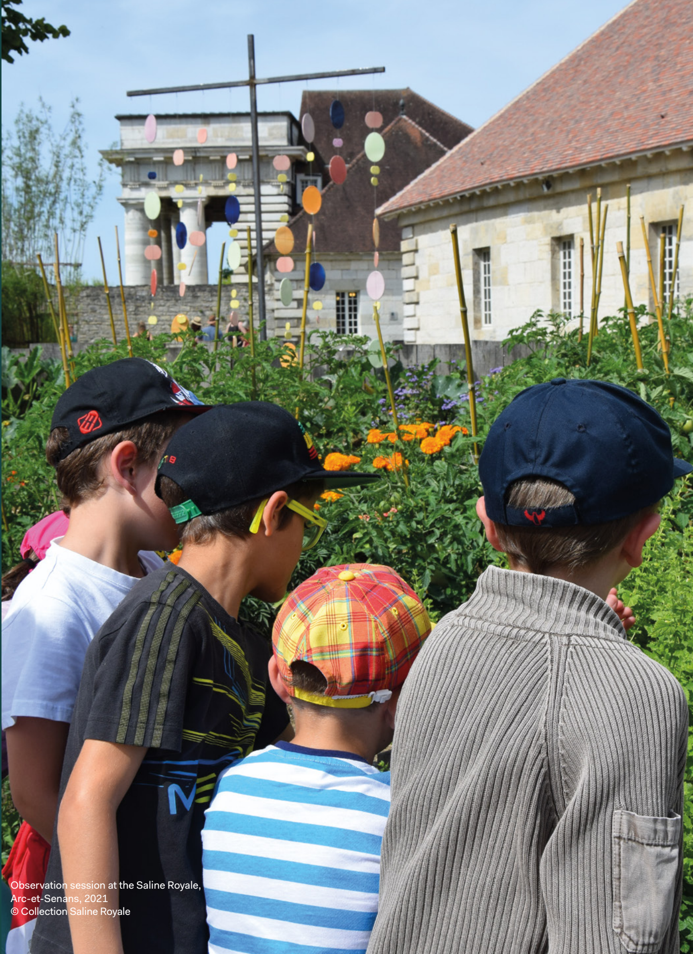
Observation session at the Saline Royale, Arc-et-Senans, 2021