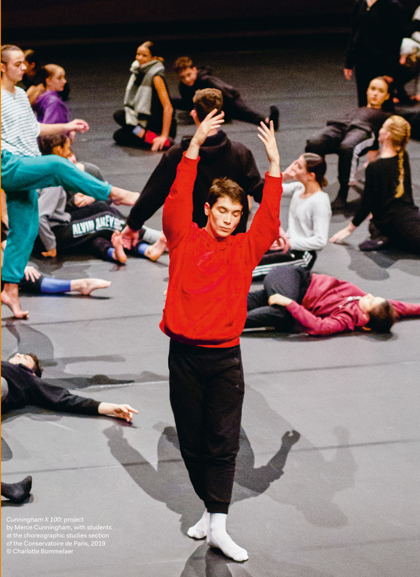
Cunningham X 100: project by Merce Cunningham, with students at the choreographic studies section of the Conservatoire de Paris, 2019