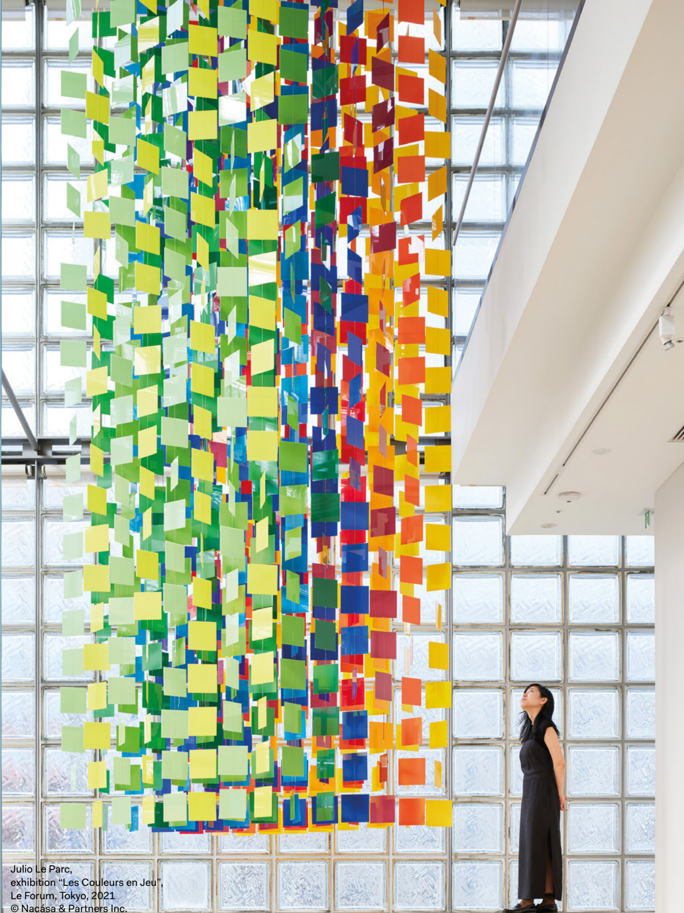
Julio Le Parc, exhibition "Les Couleurs en Jeu", Le Forum, Tokyo, 2021